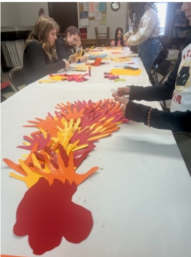
Paper Dragon design