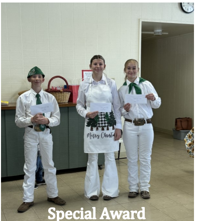
Special Award Winners—Fudge