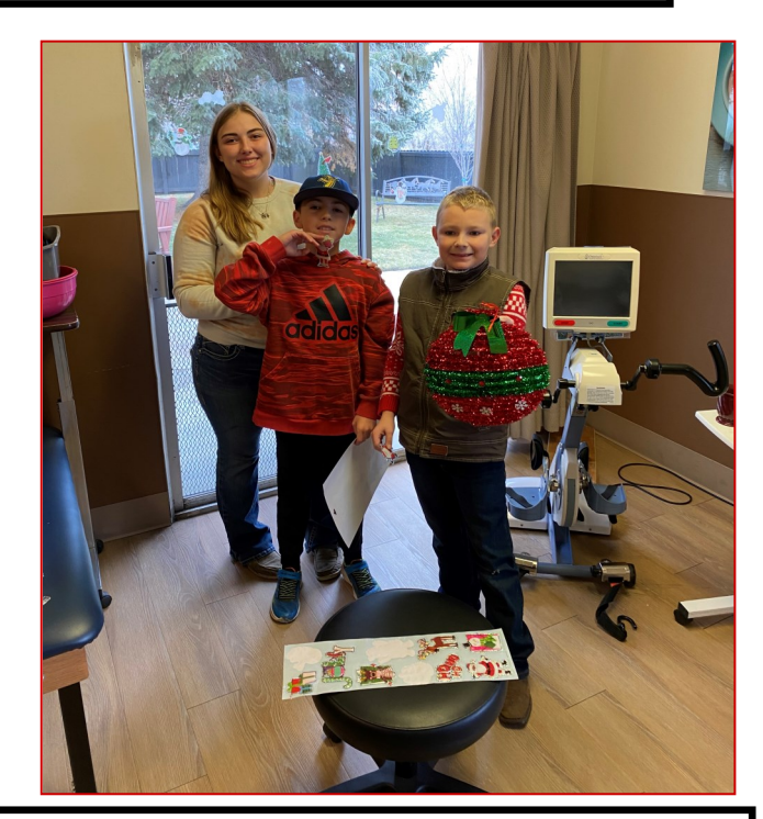
Door Decorating at Lassen Nursing and Rehabilitation Center