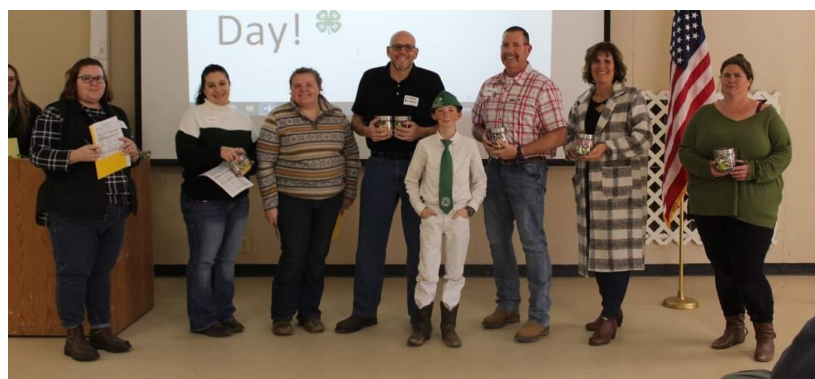
Thank you judges for volunteering to evaluate our presentations!