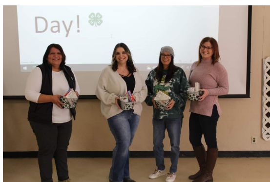
Thank you Tabulators!