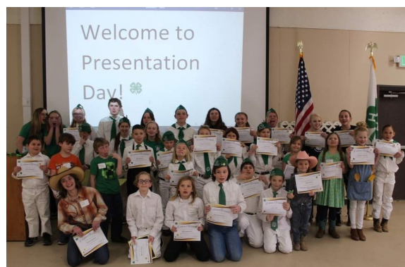
Goofy pose for the camera...