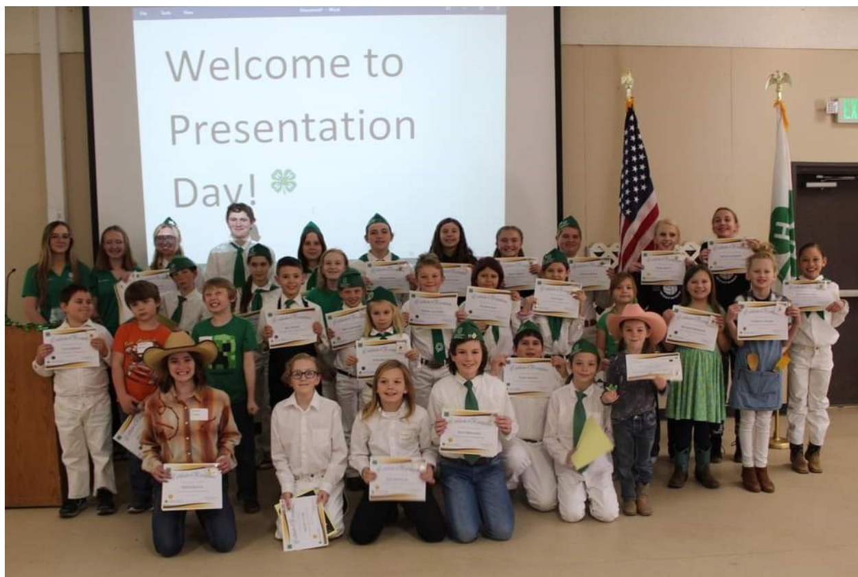
Our 4-H members who participated in 4-H Presentation Day 2023!!!