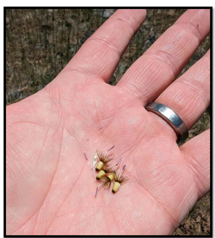
Picture Ten, Eleven and Twelve: Bottom left– Big seeds from Common crupina. Top Right– Close up of the rough foliage.

If you see little pink inconspicuous flowers take a second look. If we can keep it contained, this is actually an invasive that so far is not widespread and there is potential for us to keep it that way! The two chemistries label for control are not legal in California.... However we put out a small trial this year, and it looks like many products that have activities on asters appear to be work well for initial burndown. It will be interesting to continue to monitor the plots next year to see what residual activity we can pick up from summer treatments and fall treatments.