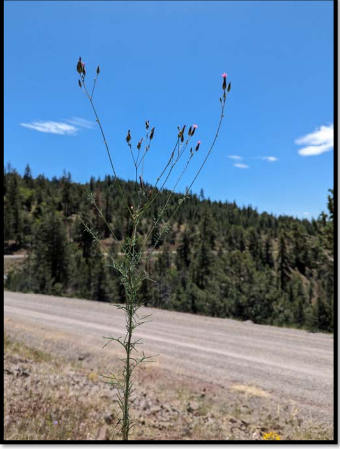
Bottom Right- Common crupina in flower