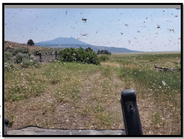
Picture Six: Grasshoppers being scared up by a quad. A common site in the intermountain region the past few years.

counts of 30-70 adult grasshoppers per square yard. In terms of synthetic insecticides there are a couple in some instances. Where on egg beds, I have worth mentioning. Dimilin (diflubenzuron) is a restricted use material, that is a growth regulating insecticide. After grasshoppers hatch they go through five instar's or growth stages before they get their wings and become adults. Dimilin works by preventing their ability to molt going through these growth stages and is ONLY effective on grasshoppers before the third instar. This is why it is so important to catch them when they are small! On benefit of Dimilin is that it has very low use rates (0.75-2 oz/ acre) and is relatively cheap at $4 per oz. Another benefit is that it has pretty good residual activity, and will stick around on the forage for a couple of weeks after treatment waiting to be consumed. It is often used in reduced area treatments (where only 50% of rangeland is treated in strips) and has been shown to be very effective. In irrigated pastures it is recommended to treat the entire acreage. Due to the selectivity of the insecticide (only affecting molting insects), and the residual activity dimilin is often the material used by the federal grasshopper programs.