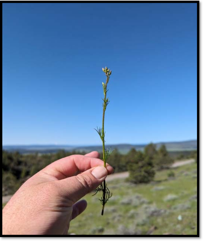
Picture Eight and Nine: Top-Small pink flower of Common Crupina. Bottom Crupina in the bud stage