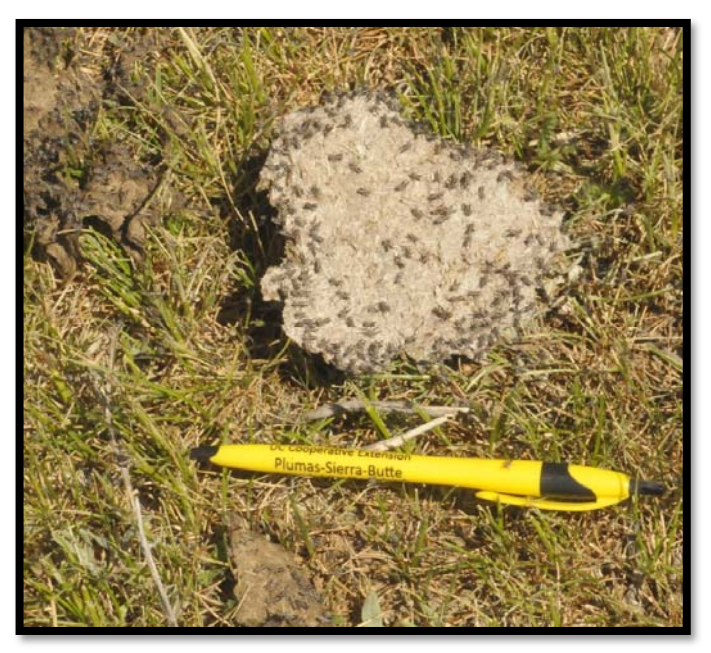
producers need help...

best dealt with on a landscape scale. Unlike aphids, problematic for producers. Unfortunately.