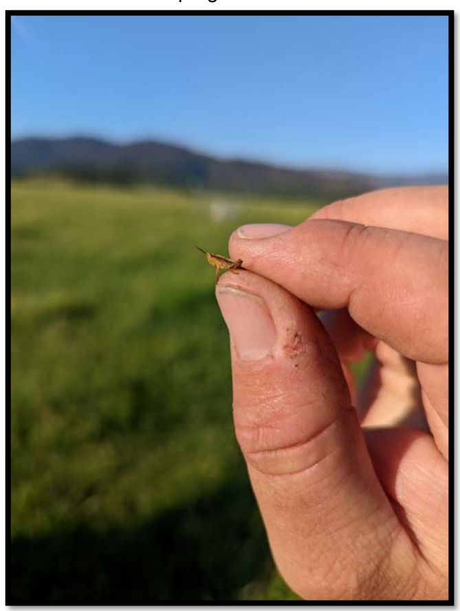
Picture Five: Grasshopper in either the 2<sup>nd</sup> or 3<sup>rd</sup>. instar. (when they can be treated)

counted over 100 nymphs per square ft, and the ground was literally moving beneath my feet. People typically notice grasshopper once they start flying, and for all intents and purposes, then it is too late for an effective control program.