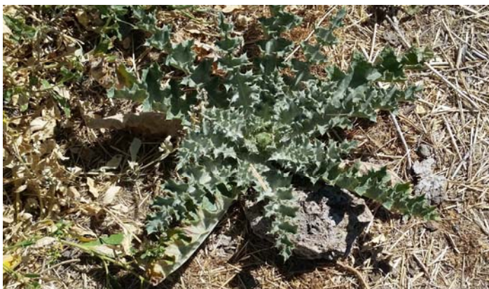
Scotch Thistle Rosette

chance to make seeds. Regardless if the plants are being dug or sprayed, they are easier to control when they are small. Finding these basal rosettes can be difficult because they are low to the ground. So one way to locate them is to look for the old dead plants from the previous growing season and you will find the basal rosettes around them. Scotch thistle, bull thistle, musk thistle, spotted knapweed, and diffuse knapweed, are some biennial weeds that can be targeted in the fall. Control of biennial plants can be as easy as severing the basal rosette